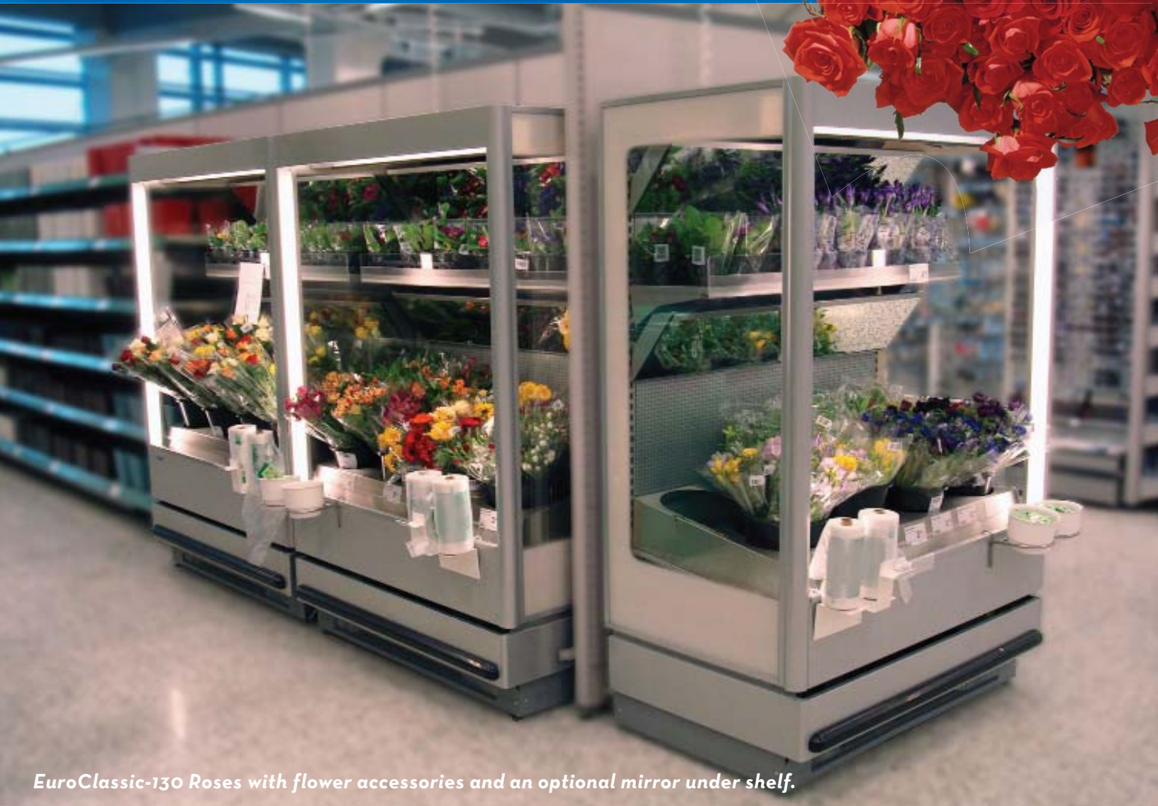
EuroClassic-130 Roses with flower accessories and an optional mirror under shelf.